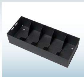
#507 Bill Tray