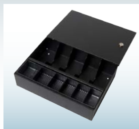
#505 Money Tray