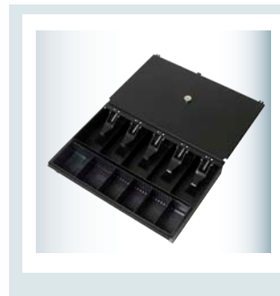
#5S Steel Money Tray