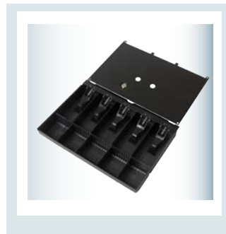
#5P Plastic Money Tray