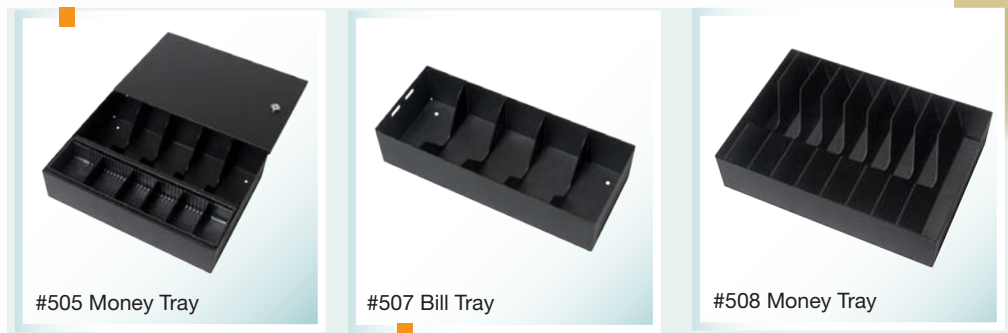
#505 Money Tray