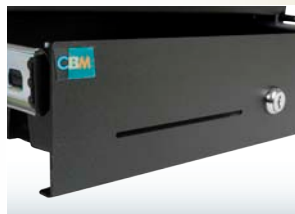
Ball bearing slide track system, dual media slots and powder coated till front