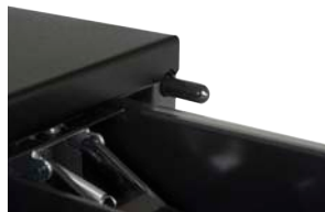
Push button drawer release