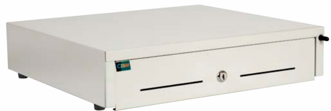
Available in Beige