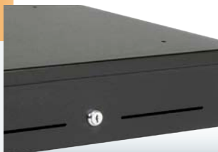
Key lock (keyed alike available)