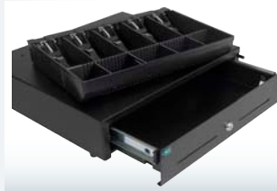
Removable #5P plastic money tray with adjustable bill and coin dividers