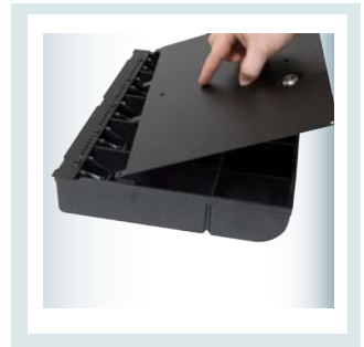
Optional Locking lid for #5 Adjustable Money Tray