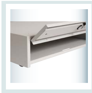
Optional Cash Tray Locker Cash Tray Locker (#A08046)