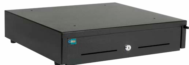
Available in Black