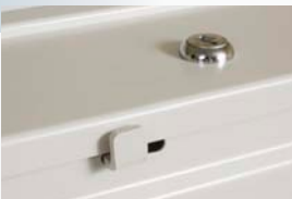
Push button drawer release