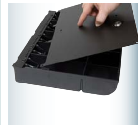
Optional Locking lid for #5 Adjustable Money Trays