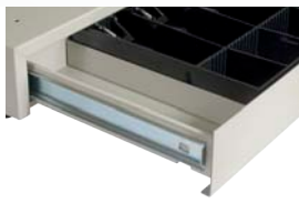
High security latch