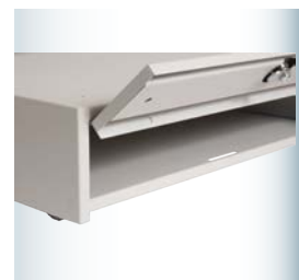
Optional Cash Tray Locker Cash Tray Locker (# A08097)