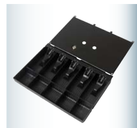
#5P Plastic Money Tray