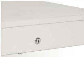
Key lock (keyed alike available)