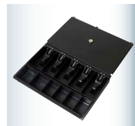
#5S Steel Money Tray