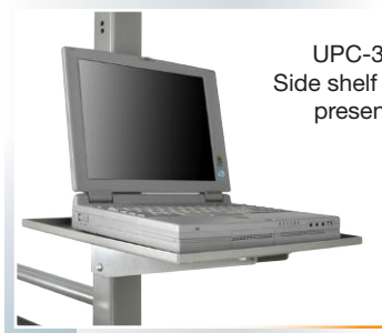
UPC-30-LTS Side shelf for laptop presentation