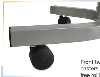
Front two locking casters - back two free rolling casters